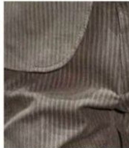
PIN STRIPE SUITING