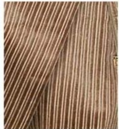
WIDE WALE CORD