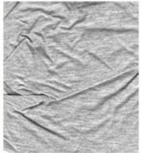
GREY HEATHER KNITS